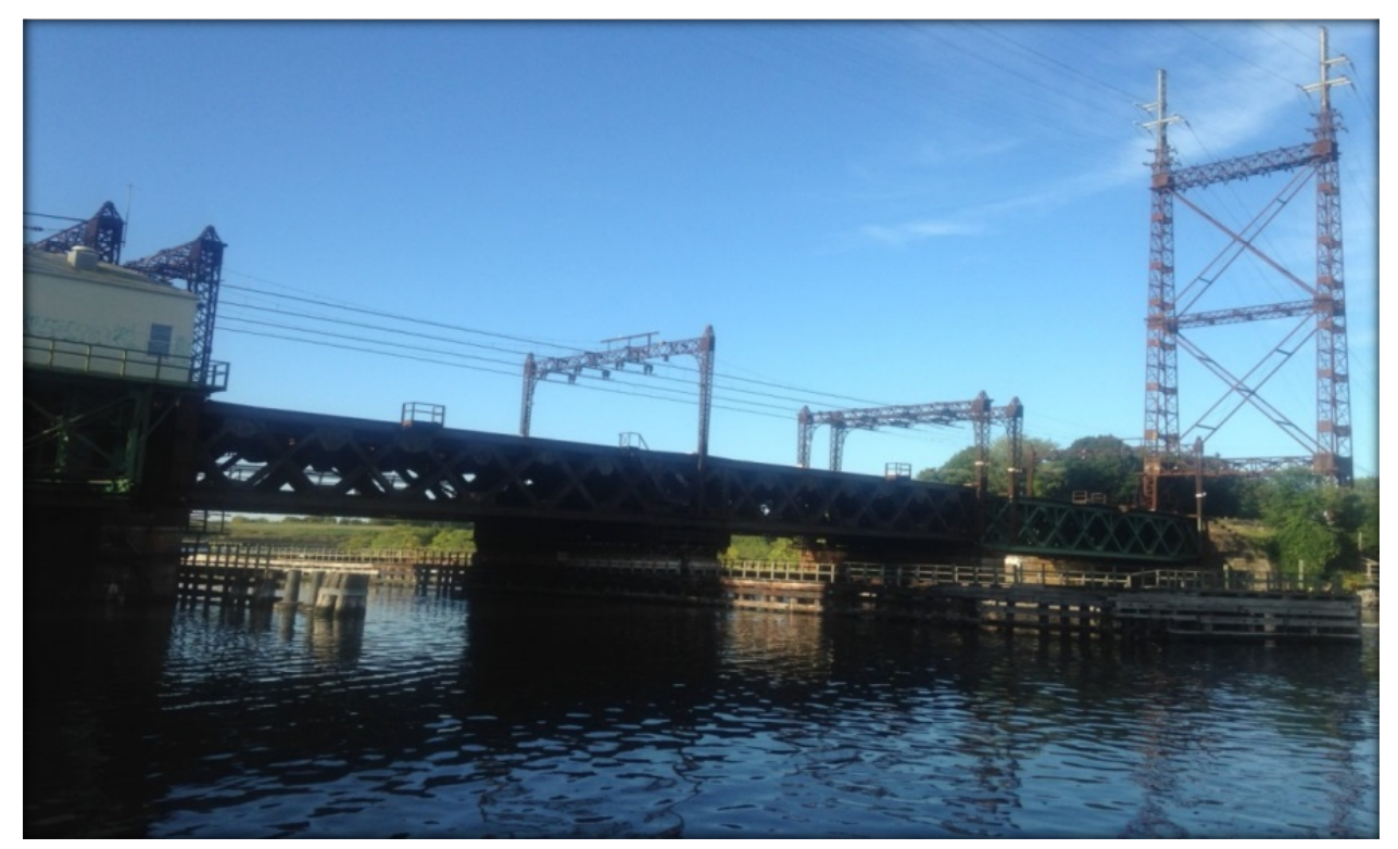
Figure 1-2—View of Walk Bridge, looking northeast

The deteriorating condition of Walk Bridge has been extensively documented over the years.<sup>6</sup> A detailed fatigue analysis was completed in 2005, and it indicated that major portions of the bridge have exceeded their fatigue life and require replacement. CTDOT performs maintenance and repairs on the bridge's structural, mechanical, and electrical systems on regular basis.